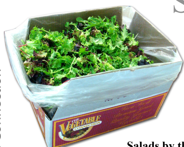
Salads by the box