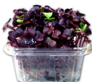
Epinard Moutarde Violet