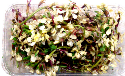
Organic Rocket Flowers